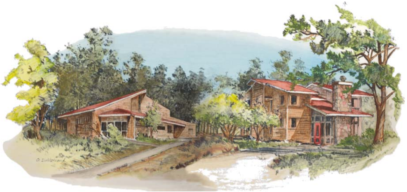
William Penn Mott Jr. Training Center